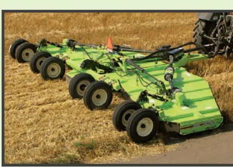
5026 in wheat straw