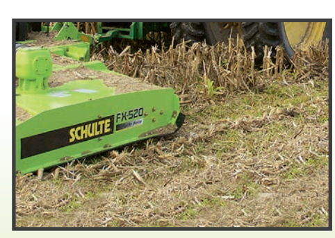
FX520 in corn