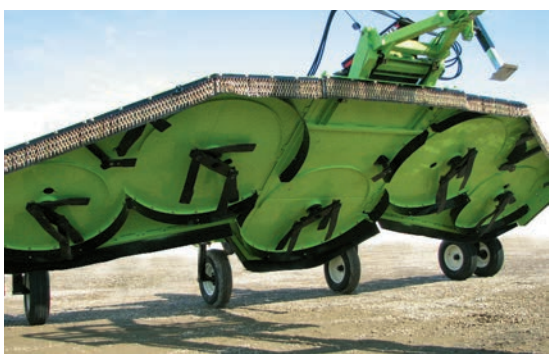
- Cutting width of 26' 2" (8 meters) - Average productivity at 7mph (11.3km/hr) = 22.06 acres/hr (8.93 hectares/hr)