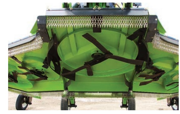
Cutting width of 20' (6 meters) Average productivity at 7mph (11.3km/hr) = 16.97 acres/hr (6.87 hectares/hr)