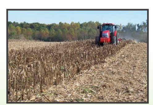
FX520 in corn