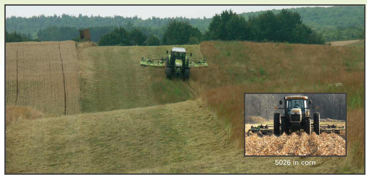
5026 shown above